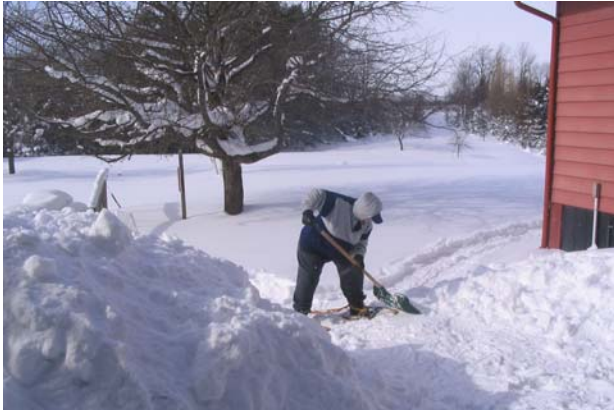
A pile of snow built close to the building where we are staying, for comfort, warmth and safety.

Pictures from previous winter camps: vary from building a Quinzee, snowshoeing, tobogganing to a quiet chat with or without crafts to the option of sleeping outside in your self build Quinzee