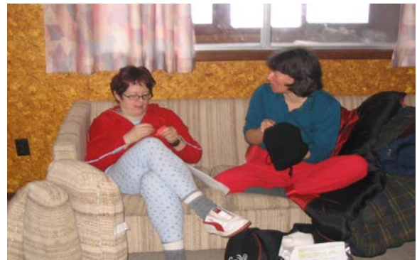
Crafts and chatting is a great way to relax