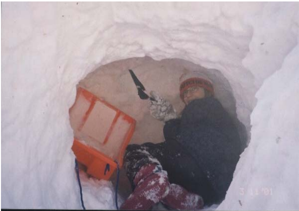
The hollowing out of the mountain of snow