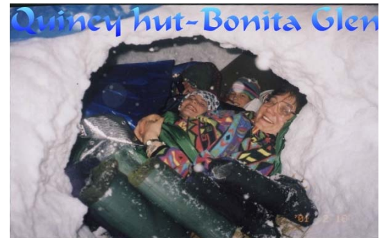
Sleeping in a Quinzee

Have you ever wanted to camp in the winter but are not sure where to start?