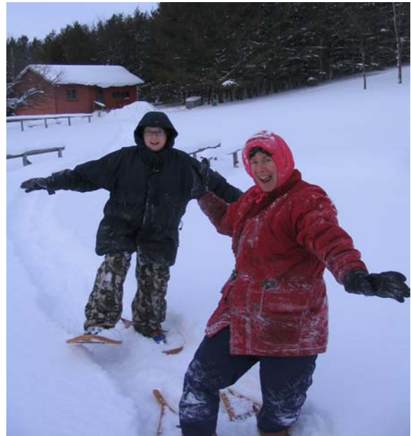
Snow shoeing in the fresh snow is a lot of fun of discovering some great sights!!