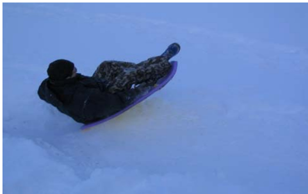
Flying in the air, when you hit a bump tobogganing down a hill is great fun!!!