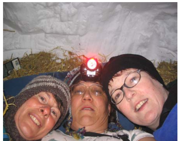
Sleeping on straw in our self build Quinzee